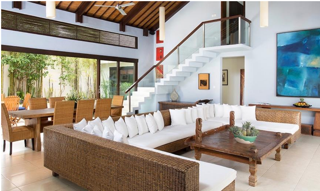
Ultra-luxe living for you and crew!