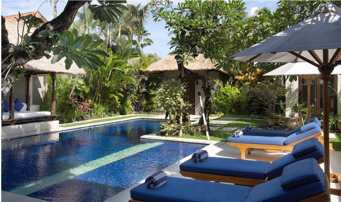
Luxury sunshine lounging – cocktail o'clock, anyone?!